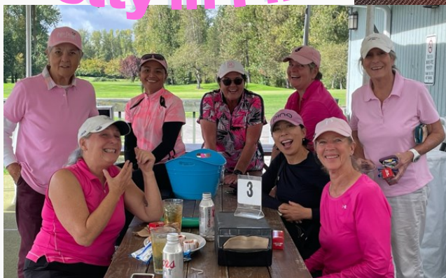
October 3rd—Pink Ball Challenge