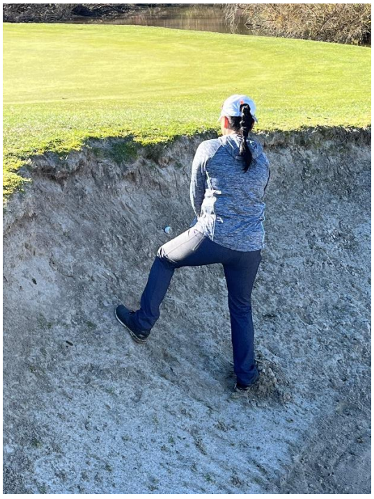
Hole 2 on Great Blue - What a bunker lie!